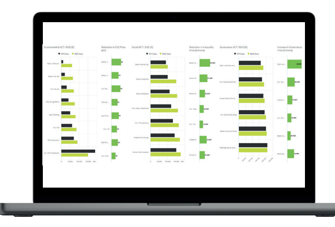
Environmental actuals vs. budget