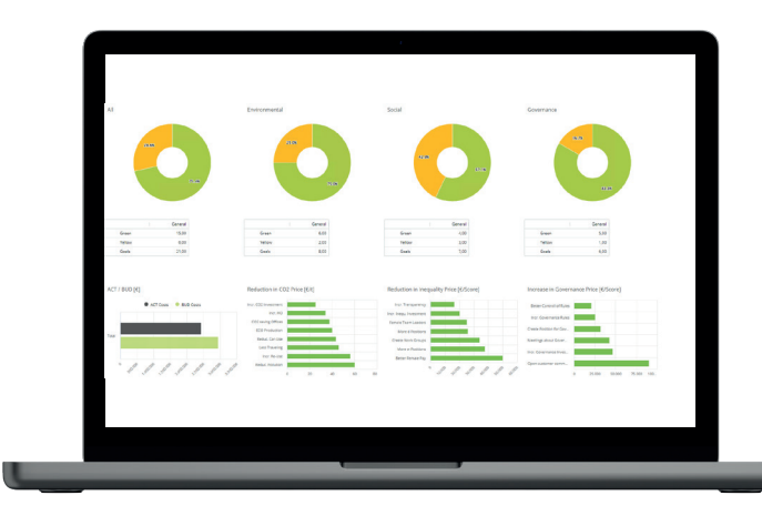
ESG dashboards including emissions, people and compliance

Unit4 FP&A is designed to assist organizations in collecting, analyzing, and reporting their Environmental, Social, and Governance (ESG) data. Although designed primarily for financial planning and analysis, our FP&A solution enables organizations to streamline data collection linked with environmental and sustainability goal tracking. Capabilities include: