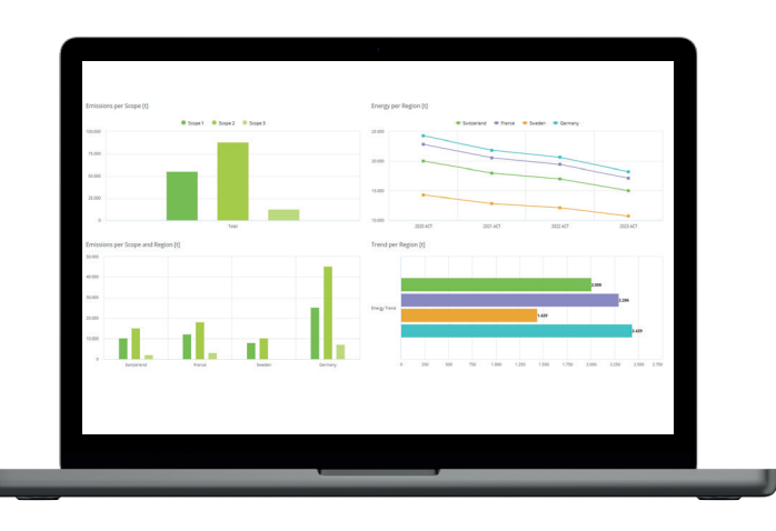
Scope emissions by type and region