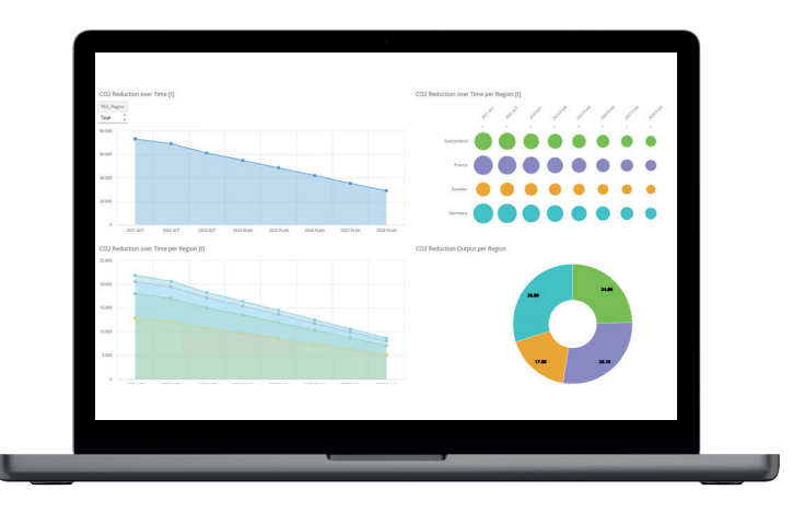
CO2 analysis over time