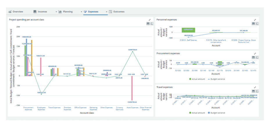
Figure 1.3 Direct project cost analysis