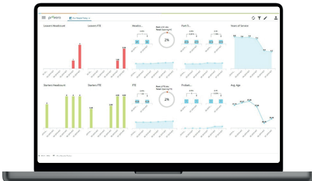
Figure 1: Dashboard - Our People today

Say hello to the future of HR planning and analytics.